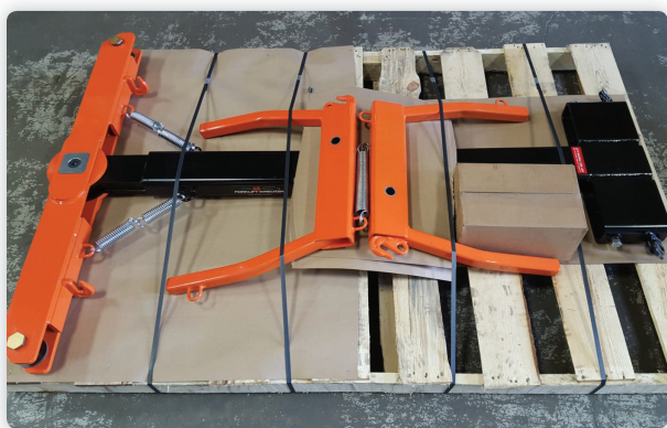
Visual of Forklift Wrecker packed pallet

Start by unpackaging the pallet's contents, and make sure all of the following components are included: